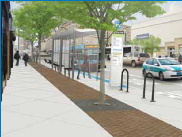
Commercial Area Showcase Station (Jeffery/71st)

Jump can make your life easier, giving you more time to spend on the things you love.